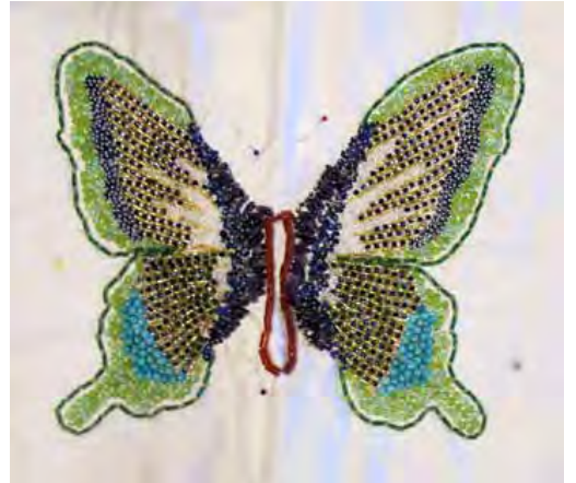
Wendy Frese's beaded liturgical hanging