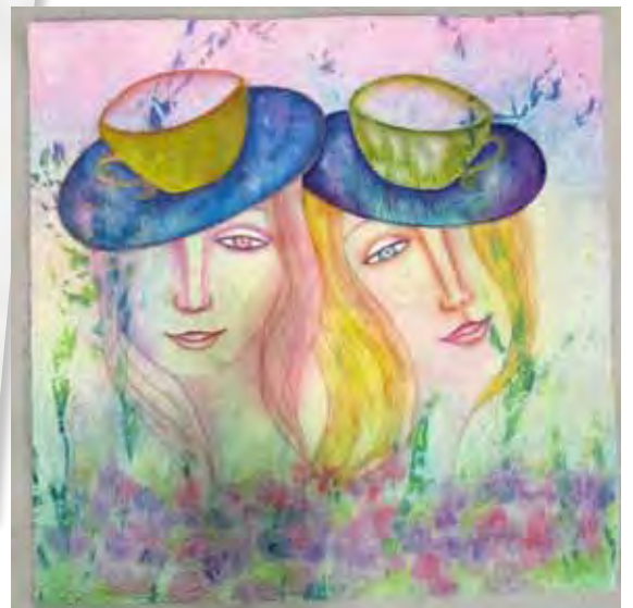
Fannie Narte's thread-painted wall hanging