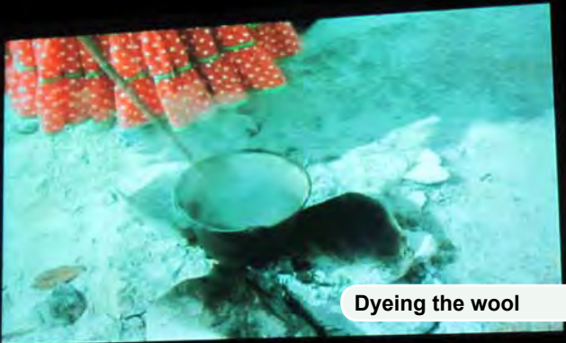
Dyeing the wool