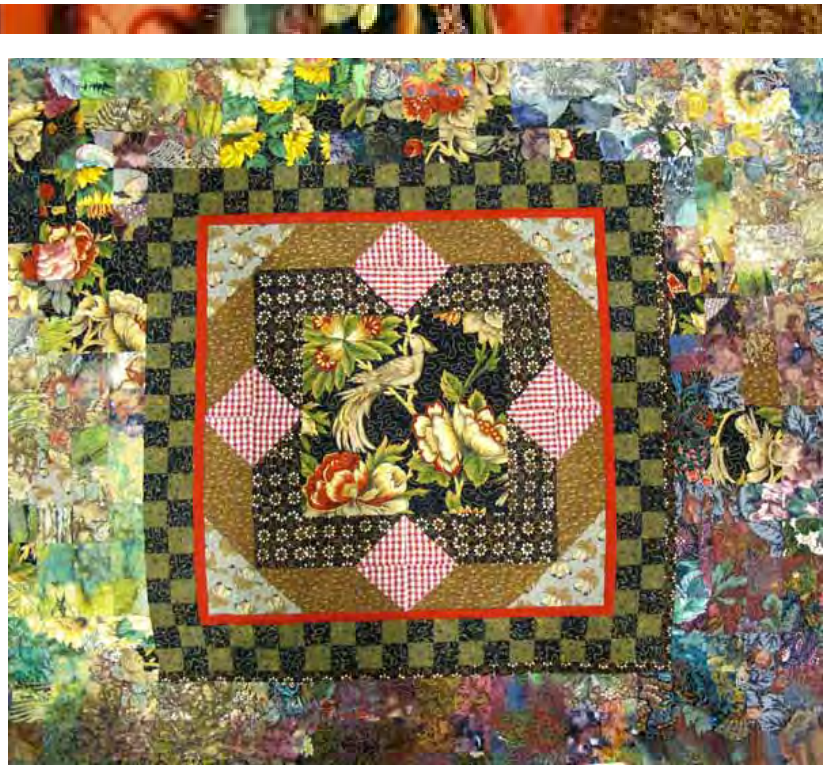
Detail, Dot Clarke's patchwork and watercolor quilt