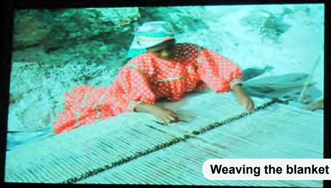
Weaving the blanket