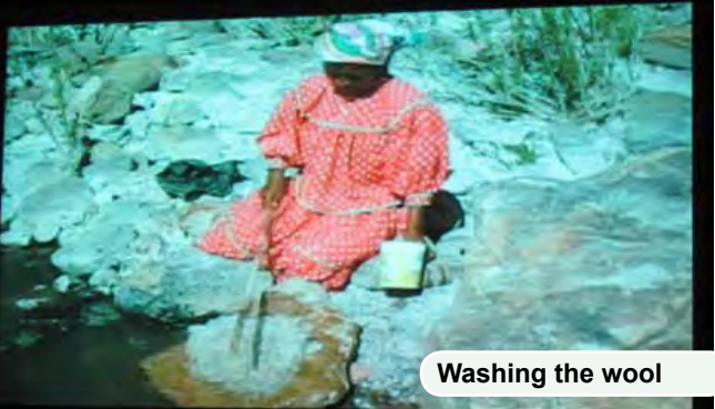
Washing the wool