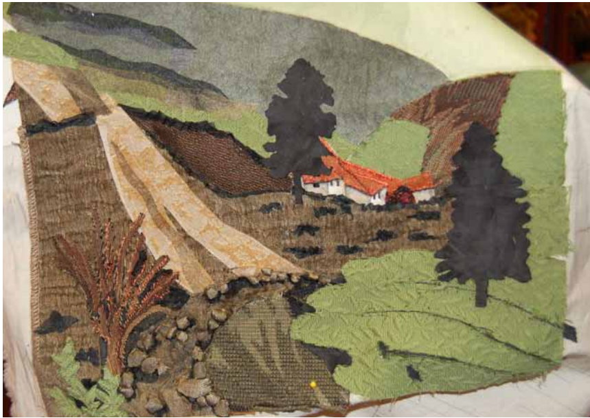
Cassie Curnutt's raw-edge applique