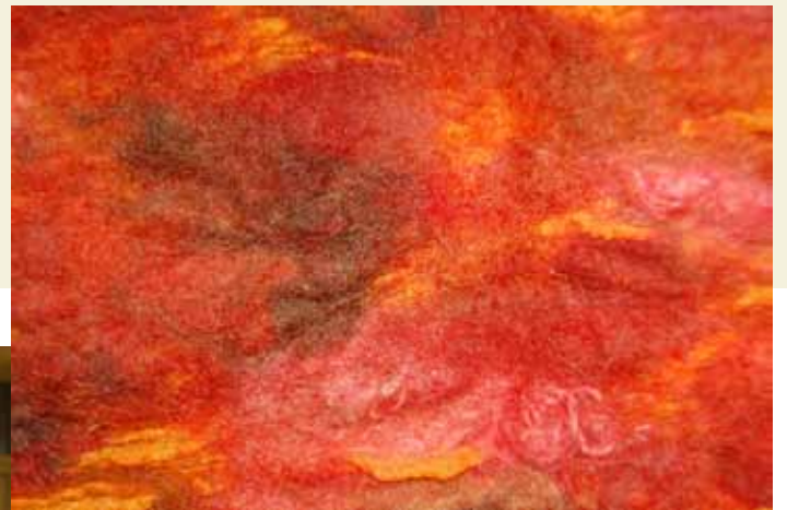
Audrey Legatowicz's felting