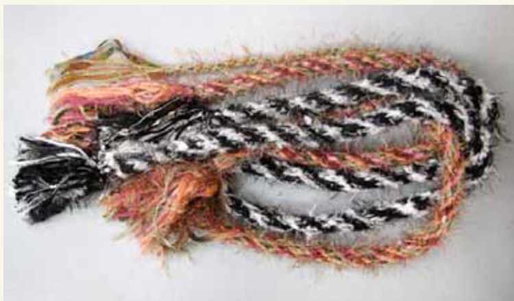
Kelly Pevehouse's Japanese braids