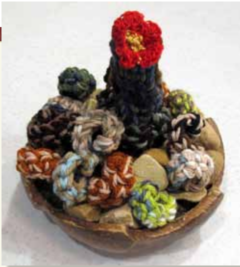
Fermin Coronado's crocheted desert scene