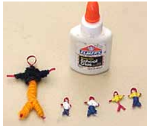
VET’s worry dolls