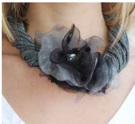
Melanie Fredrickson’s organza flower