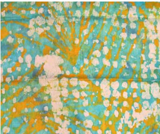
Detail, April Soncrant's wax-resist hand-dyed silk.